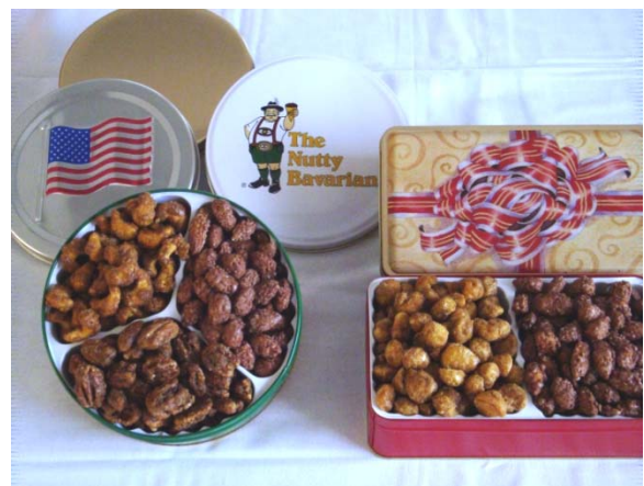
Gift Tin Varieties – Nutty Bavarian Logo Tin Shown in Center

The key to a successful holiday season is to have a great variety of gift packaging for sale. Call us for pricing on gift containers and ideas on how to merchandise them from your venue.