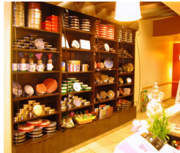
Gift Displays Inside Store