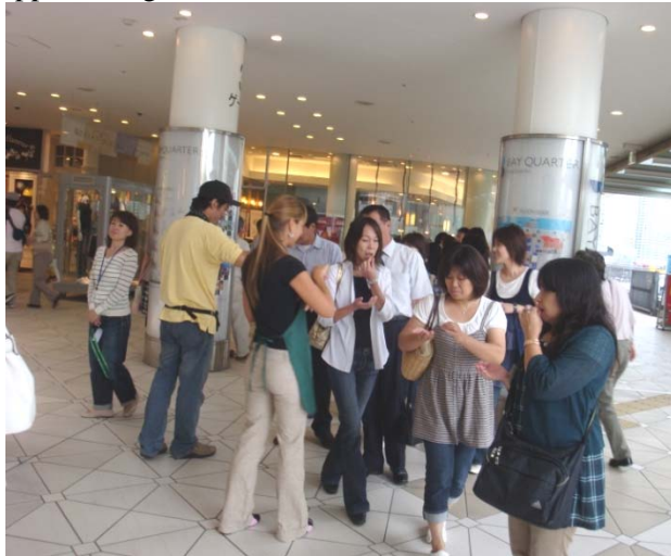
Lining up for samples in Yokohama, Japan