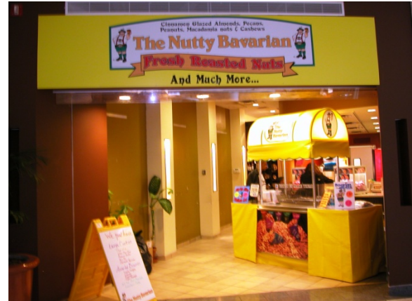
Front of Store