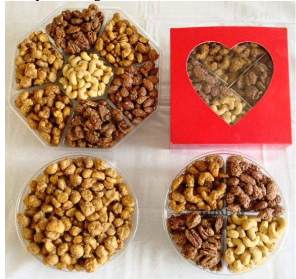
Available gift containers

Gift containers and large gift cones are a must for increased sales in malls and at festivals – especially during the holiday season. The Nutty Bavarian stocks single compartment, 4 compartment, and 7 compartment plastic containers. We also stock large gift cones. You can also merchandise the glazed nuts from gift tins themed for the holiday. The Nutty Bavarian has three compartment logo gift tins in stock and we can point you towards suppliers for holiday themed gift tins..