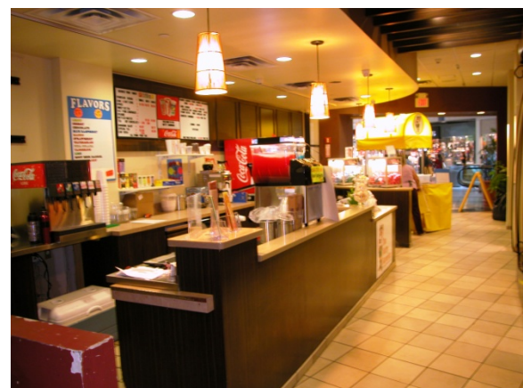
View from Store Interior